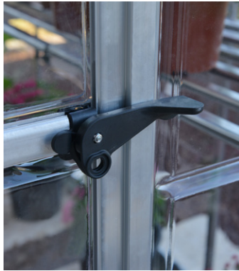
Lockable door handle